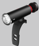
PWR COMMUTER 450 LUMENS / 850mAh