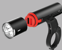
PWR ROAD 600 LUMENS / 3350mAh