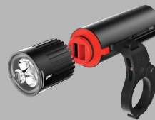
PWR TRAIL 1000 LUMENS / 5000mAh