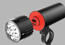
PWR MOUNTAIN 1800 LUMENS / 10,000mAh

These lights have interchangeable parts - so all lightheads can fit on all PWR Banks.