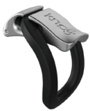
SHORT FOR BAR DIAMETER 22-27MM