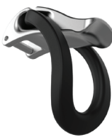
MEDIUM FOR BAR DIAMETER 27-32MM