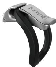
LARGE (REAR ONLY) FOR BAR DIAMETER 32+MM